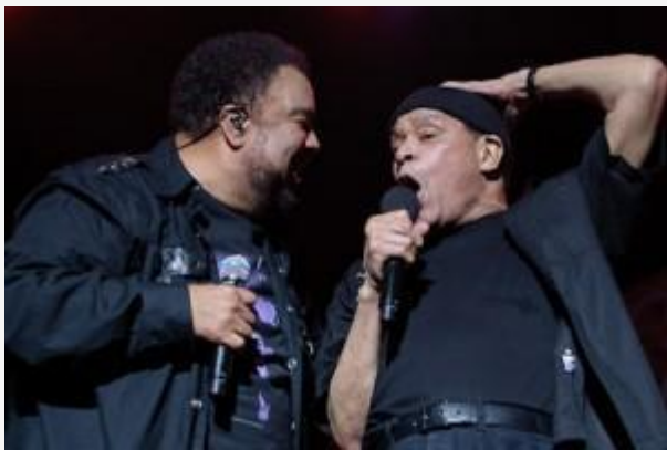
George Duke with Al Jarreau

Read the excellent interview by Smooth Views about this album's evolution. Had the Duke lived to hear his 10 songs on the album, he might have called it 'ear candy'. There are some sweet, some sour, sassy and sarcastic, but always soulful renditions of Duke's tunes from the artist heavyweights who joined Jarreau.