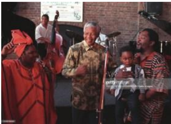
CAPE TOWN, SOUTH AFRICA – 1997: Nelson Mandela singing and dancing with South African jazz singer Sylvia Mdunyelwa at his staff party at Green Dolphin Restaurant, V&A Waterfront, Cape Town.

These days, one can see McCoy more often with a Sony video camera on a tripod than with a saxophone. He’s making his own documentary, a selfie, with a self-taught approach including learning and using Final Cut Pro, his editing tool. “The purpose is to show my upbringing in an urban township of Cape Town, even though my ancestry comes from Heuwu village in the Cala area of the Eastern Cape. Then explain the musical journey I’ve had, again focusing on intergenerational relationships.” For instance, during his recent studio recording session in Cape Town with the legendary ‘Mama Kaap’ singer, Sylvia Mdunyelwa, also a long time resident in Langa, he filmed her with his tripod setup. “It was so emotional: she was crying as she sang, because the lyrics of my song were written by her own son who works with me!”